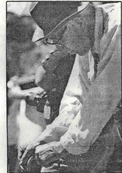
A man bows his head during the services.